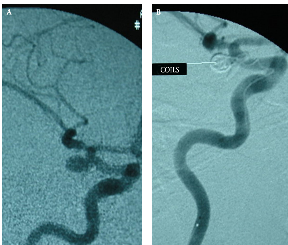
Figure 1. Total coil embolization in a 49-year-old man with right internal carotid artery aneurysm. A, Before coil embolization. B, After coil embolization

Although aneurysms that remained unchanged after six months follow-up angiography had total occlusion after the procedure, this was 50% for those aneurysms that had any changes in 6 months follow up angiography (P value = 0.01).